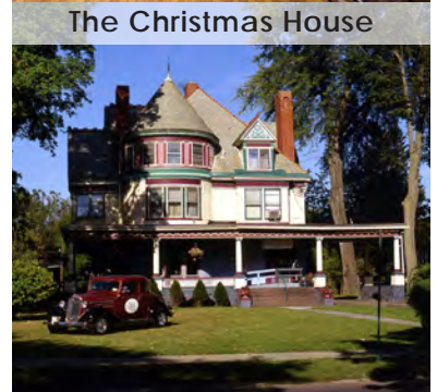
The Christmas House