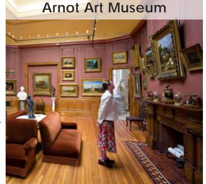
Arnot Art Museum