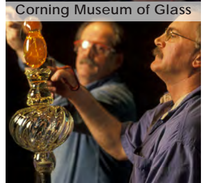
Corning Museum of Glass

ELMIRA, NEW YORK. PROUD TO BE WHERE TWAIN REMAINS.